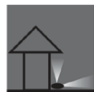
Wall and Pathway